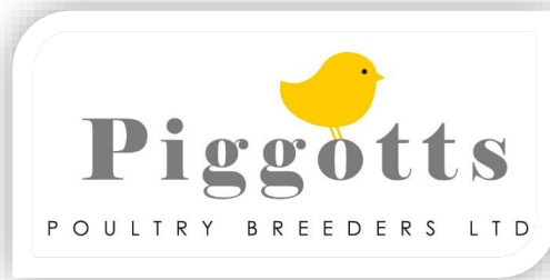
Table Meat chicks at a glance

Our complete list of table meat chicks is available from September 2014 onwards: